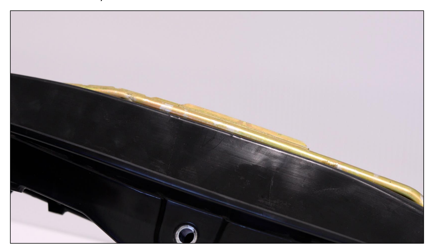
End of installation.